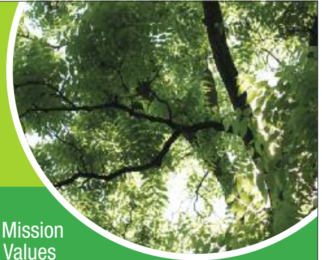
Photo: Black walnut ( Juglans nigra )