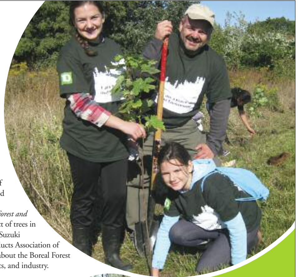
Photo: Another maple tree well planted thanks to TD employees at TD Tree Days