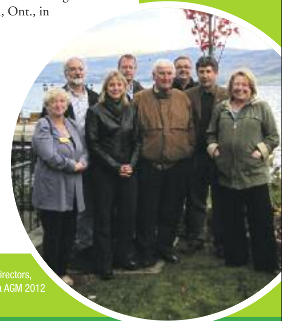
Photo: Board of Directors, Kelowna AGM 2012

Thank you! Because of your help, we now have a beautiful school ground!