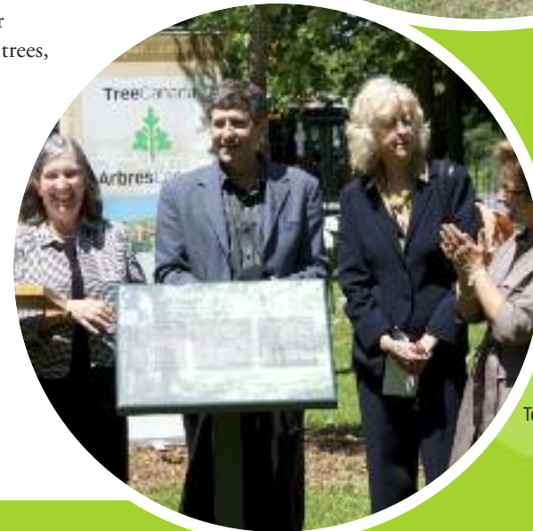
Photo: Healing Trees pilot project at the Canadian Association of Mental Health, Toronto ON