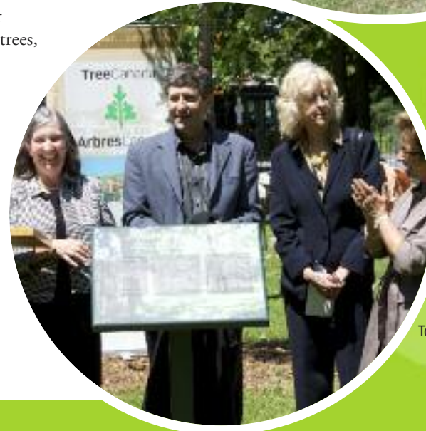
Photo: Healing Trees pilot project at the Canadian Association of Mental Health, Toronto ON