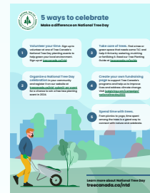
Infographic: 5 ways to celebrate

In addition to promoting your event, Tree Canada wants to empower individuals, organizations, and communities to help grow and nurture local greenspaces. We have developed resources on how to plant and maintain trees.