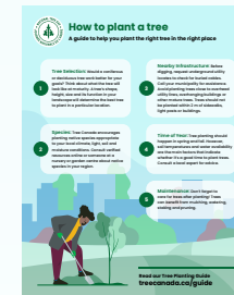
Infographic: How to plant a tree