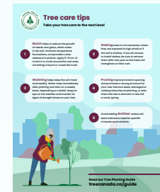
Infographic: Tree care tips